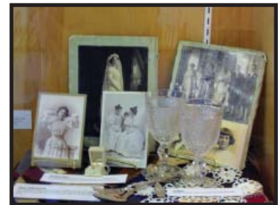
Love is in the Air

Love is in the Air-A look at wedding dress, photos & gifts of the past.